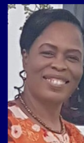
I AM the Way the Truth and the Life