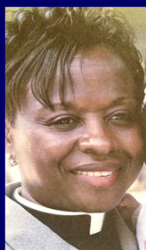
I AM the Door of the Sheep