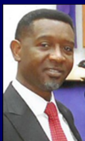
I AM the Light of the World