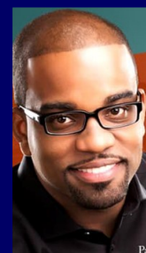
I AM the True Vine