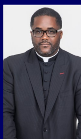
I AM the Good Shepherd