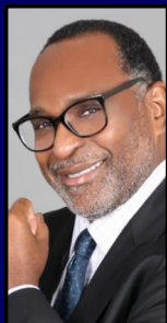
I AM the Bread of Life