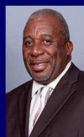
I AM the Resurrection and the Life

Friday - January 7, 2022 2:00 P.M. - 4:30 P.M. EST District Goals, Officers' Reports, Learning Lab