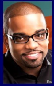
I AM the True Vine