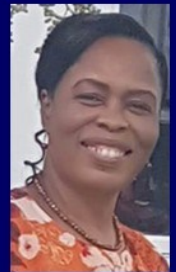
I AM the Way the Truth and the Life