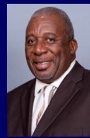
I AM the Resurrection and the Life

Friday - January 7, 2022 2:00 P.M. - 4:30 P.M. EST Officers' Reports, Leadership Learning Lab 6:45 P.M. EST Worship Experience - Jesus' Seven I AM Statements Saturday - January 8, 2022 8:30 A.M. - Noon EST District Work/Reports, Succession Planning Lab