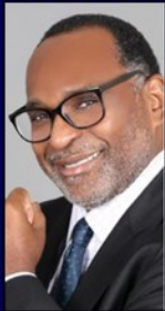
I AM the Bread of Life