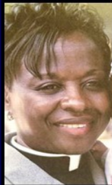
I AM the Door of the Sheep