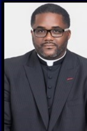
I AM the Good Shepherd