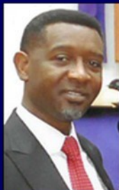
I AM the Light of the World