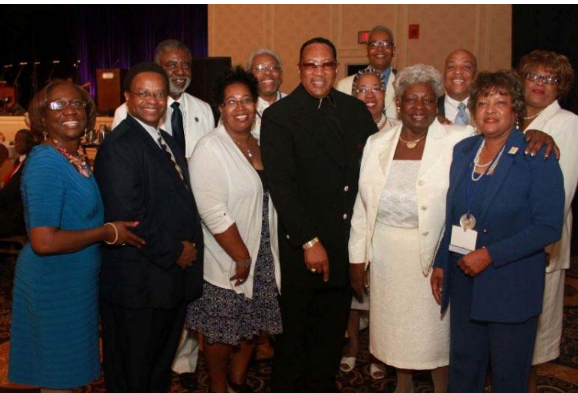
The purpose of the Lay Organization is to organize and train the lay members of the African Methodist Episcopal Church, so that each member may utilize to the maximum the abilities and skills granted by God, in assisting with the improvement and extension of God's kingdom, and creating happiness, peace and harmony among its members.